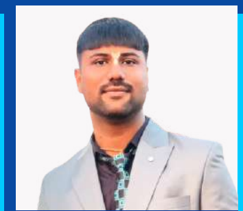
Prince 6.5 LPA Neustorino