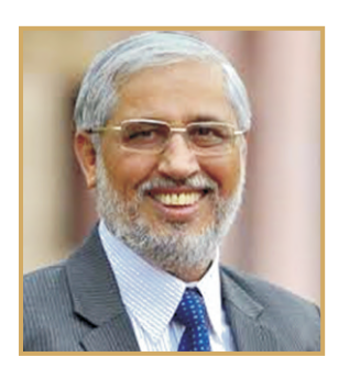
Anil D Sahasrabudhe Chairman, AICTE

I am very happy to see that the detailed guidelines have been issued by Ministry of Human Resource Development on National Innovation and Startup Policy for students and faculties of higher education institutions which further strengthens the Startup Policy released by All India Council of Technical Education in November 2016 from Rashtrapati Bhawan, just after few months of Startup action plan announced by the Government of India in January 2016.